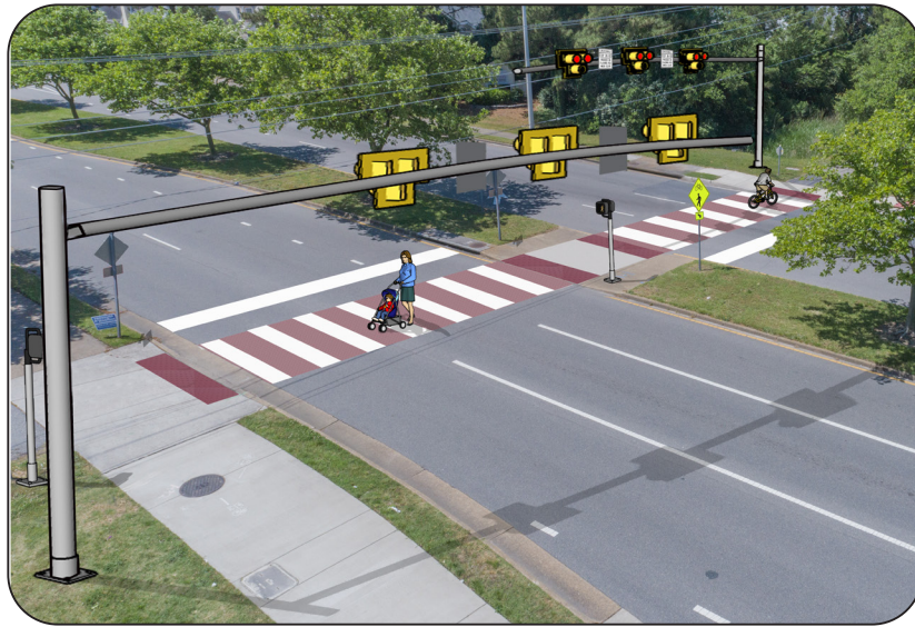
Photo Simulation of HAWK Beacon at North Great Neck Road and Cape Henry Trail