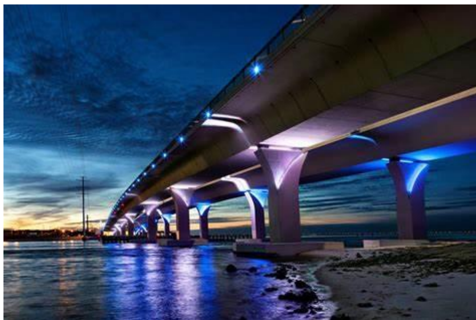
Lesner Bridge

Newsletter of the Virginia Beach Bayfront Advisory Commission