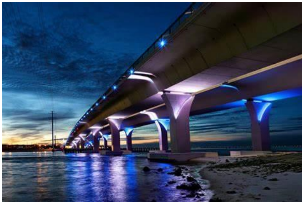
Lesner Bridge

Newsletter of the Virginia Beach Bayfront Advisory Commission