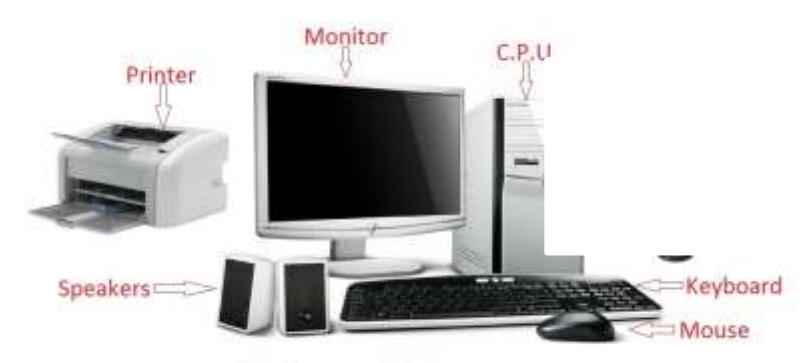
Basic parts of a Computer