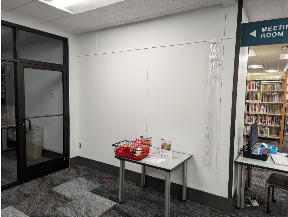
Image 6: Wall Five by the front entrance, lit from above, with a meeting room sign and a table displaying flyers.