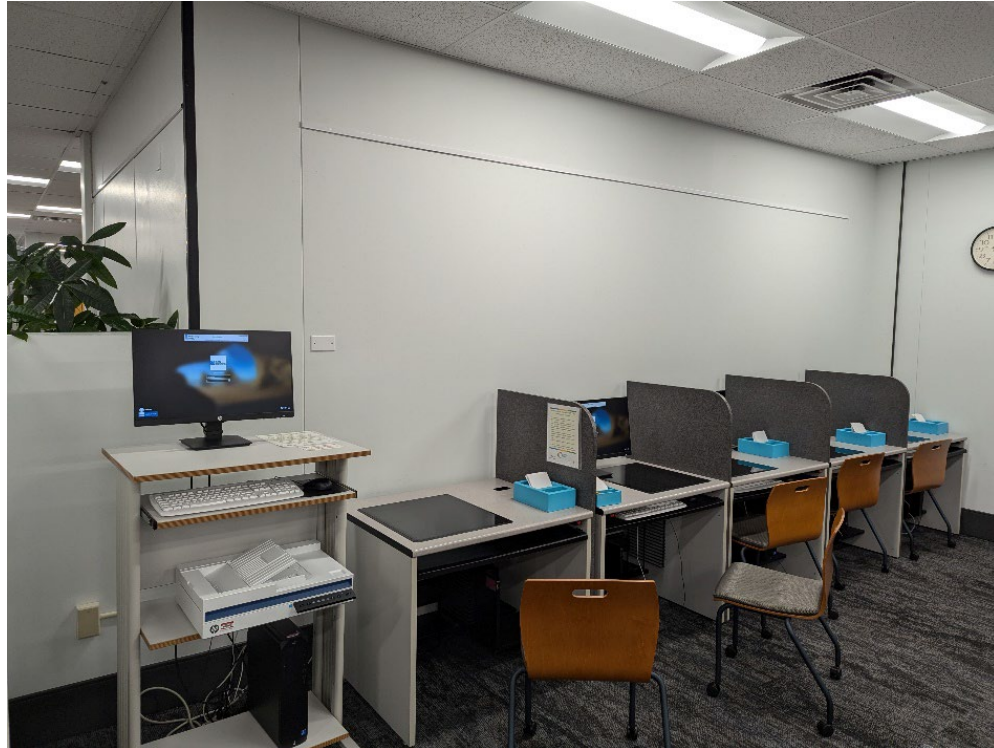
Image 3: Wall Two with five cubicles and a standalone workstation under bright overhead lighting.