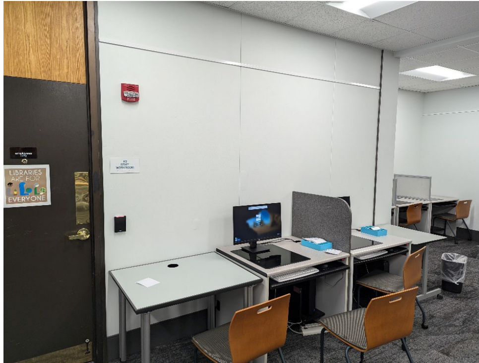
Image 4: Gallery Wall Three with a row of desks holding computers, chairs, and privacy dividers beneath overhead lighting.