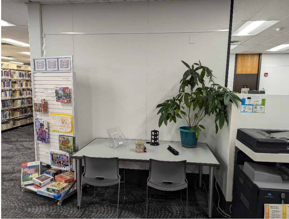
Image 2: Wall One with a table, two chairs, and a large potted plant.