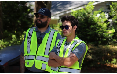
Tidewater EMS Council