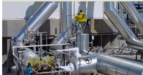
Urethane Pipe Insulation with Aluminum Jacketing