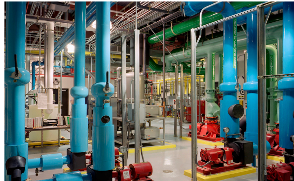
Mechanical Insulation with Color-Coded PVC Jacketing

Our rigorous safety standards and training create safe working conditions. PCI is bonded and insured for your protection.