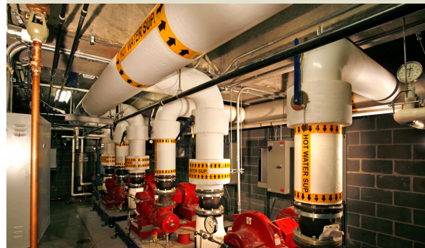
Insulation with ASJ Jacketing