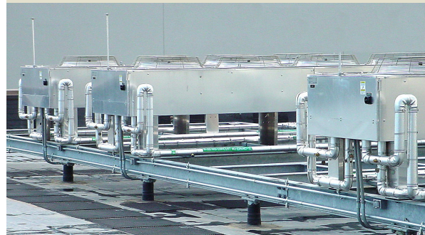
Refrigerant Lines with Armaflex and Metal Jacketing