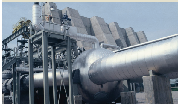
Industrial Insulation Services for the Nuclear Industry