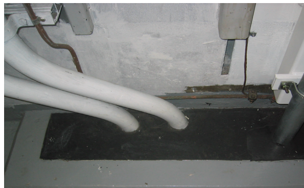
PCI Promatec Passive Fire Protection Services

With our national resources and local expertise, PCI offers a "single-source" solution. Only PCI is capable of combining our superior range of services, equipment, purchasing power, labor control, and knowledge of nuclear safety requirements to give you fast, comprehensive service for all your nuclear service needs.