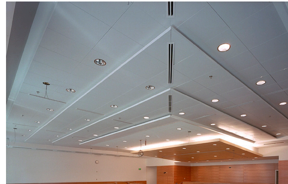
Custom Acoustical Ceilings