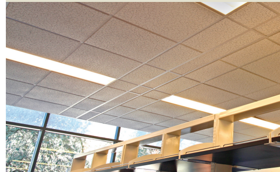
Traditional Acoustical Ceilings