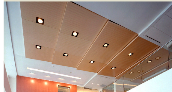
Fabric-Wrapped Acoustical Ceiling Panels

How can we help? Call 1-800-255-6886 or visit PCG.com to locate the PCI branch near you.