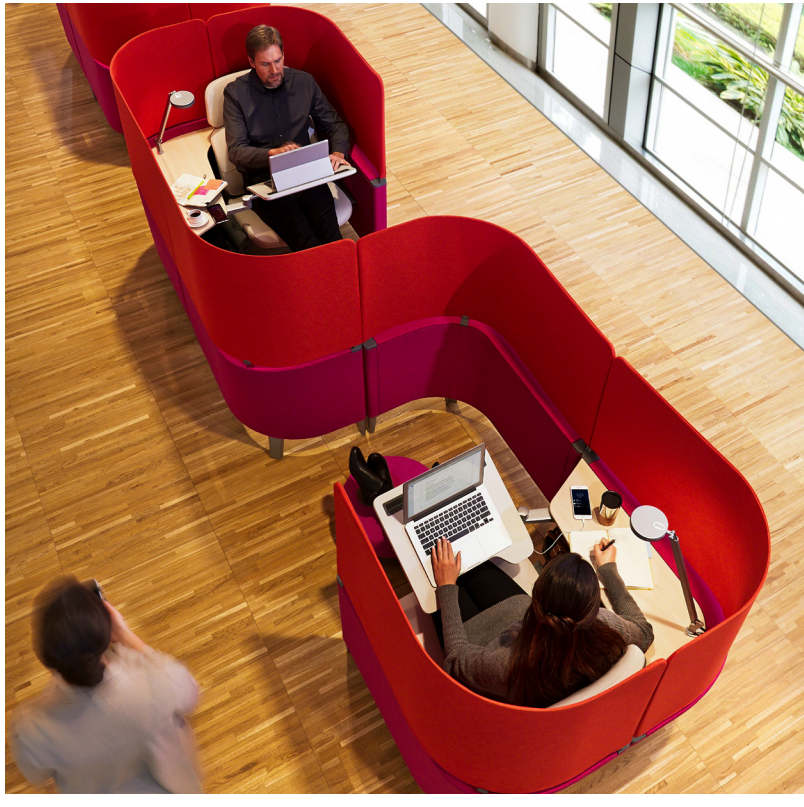
4-5-6 CENTURY DRIVE, PARSIPPANY NJ 07054