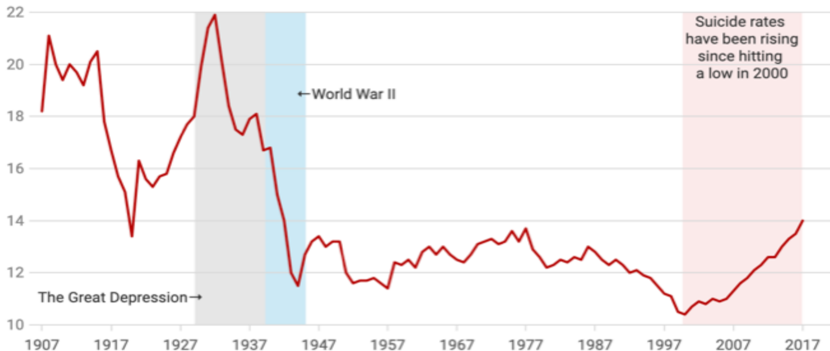
Chart: Jamie Ducharme for TIME • Created with Datawrapper

U.S. suicide rates are at their highest since World War II, according to federal data—and the opioid crisis, widespread social media use and high rates of stress may be among the myriad contributing factors.