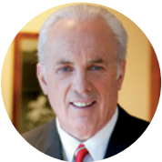
John MacArthur Pastor-Teacher

In Ephesians 4:11–14, the apostle Paul writes that church leaders are God’s agents in building the church as they equip the saints for the work of the ministry. Our church has been blessed with godly elders who shepherd us willingly, eagerly, and humbly. As we begin a new year, take a moment to become familiar with our elders, along with their primary areas of service.