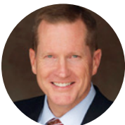
Chris Hamilton Foundation