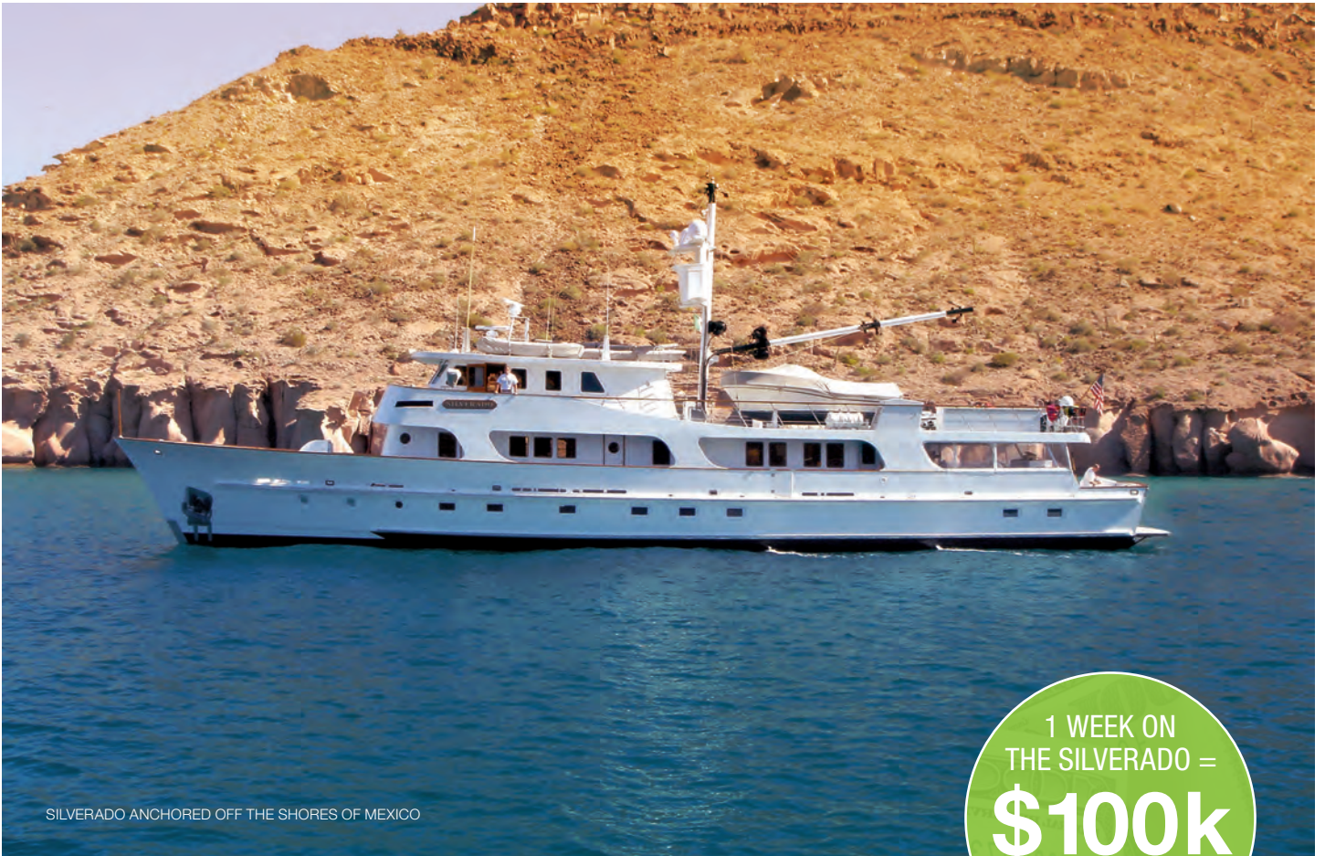
SILVERADO ANCHORED OFF THE SHORES OF MEXICO