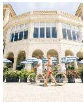
CASA DEL MAR