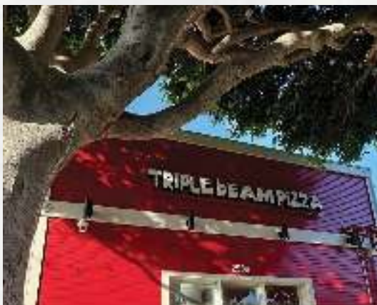
TRIPLE BEAM PIZZA (NANCY FULLERTON GROUP)