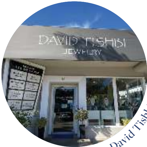
David Tishbi Jewelry