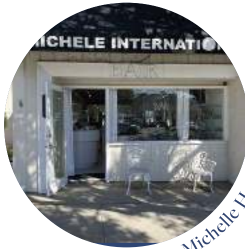
Michelle Hair International