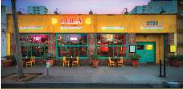
LULA COCINA MEXICANA