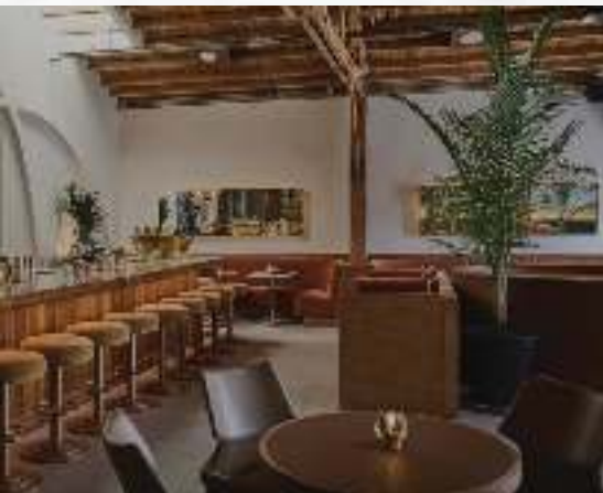
EDGEMAR RESTAURANT + LOUNGE