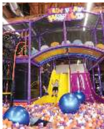
FUN PLAY WORLD