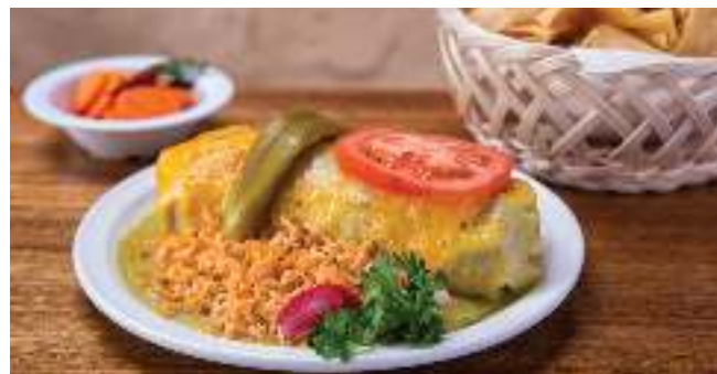
GILBERT'S EL INDIO