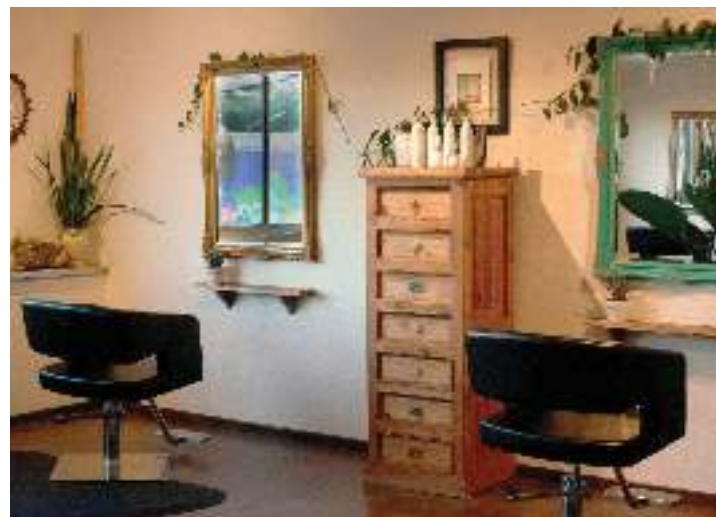
ECO HEADS SALON