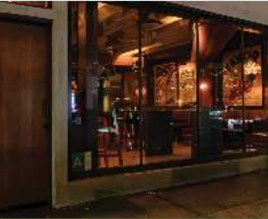
NOT NO BAR