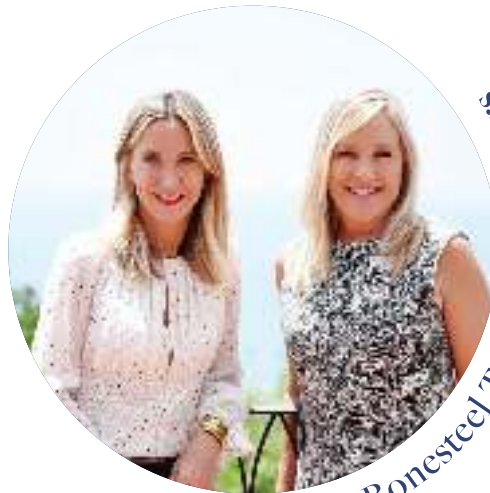
Bonesteel Trout Hall Interiors