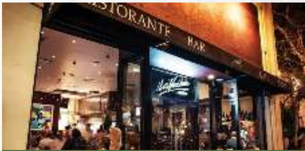
LA VECCHIA CUCINA