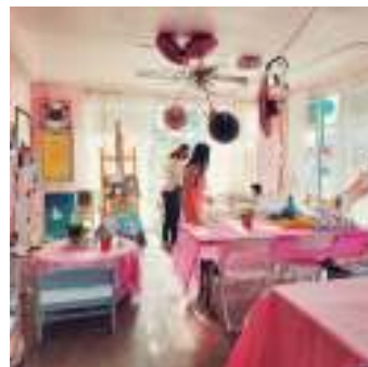
THE MAGICAL ATELIER