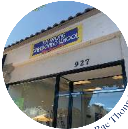
Rac Thong Taekwondo