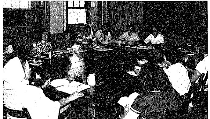
The Graduate Institute in Liberal Education

contributions to the western campus will grow more rapidly.