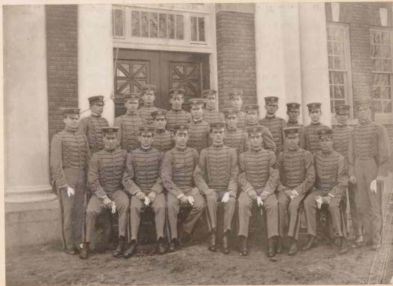
THE PHILOMATHEAN LITERARY SOCIETY