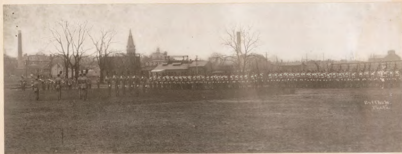
FULL DRESS PARADE, BATTALION IN LINE ST. JOHN'S IS CLASSED BY THE WAR DEPARTMENT AS AMONG THE VERY BEST MILITARY SCHOOLS IN THE UNITED STATES