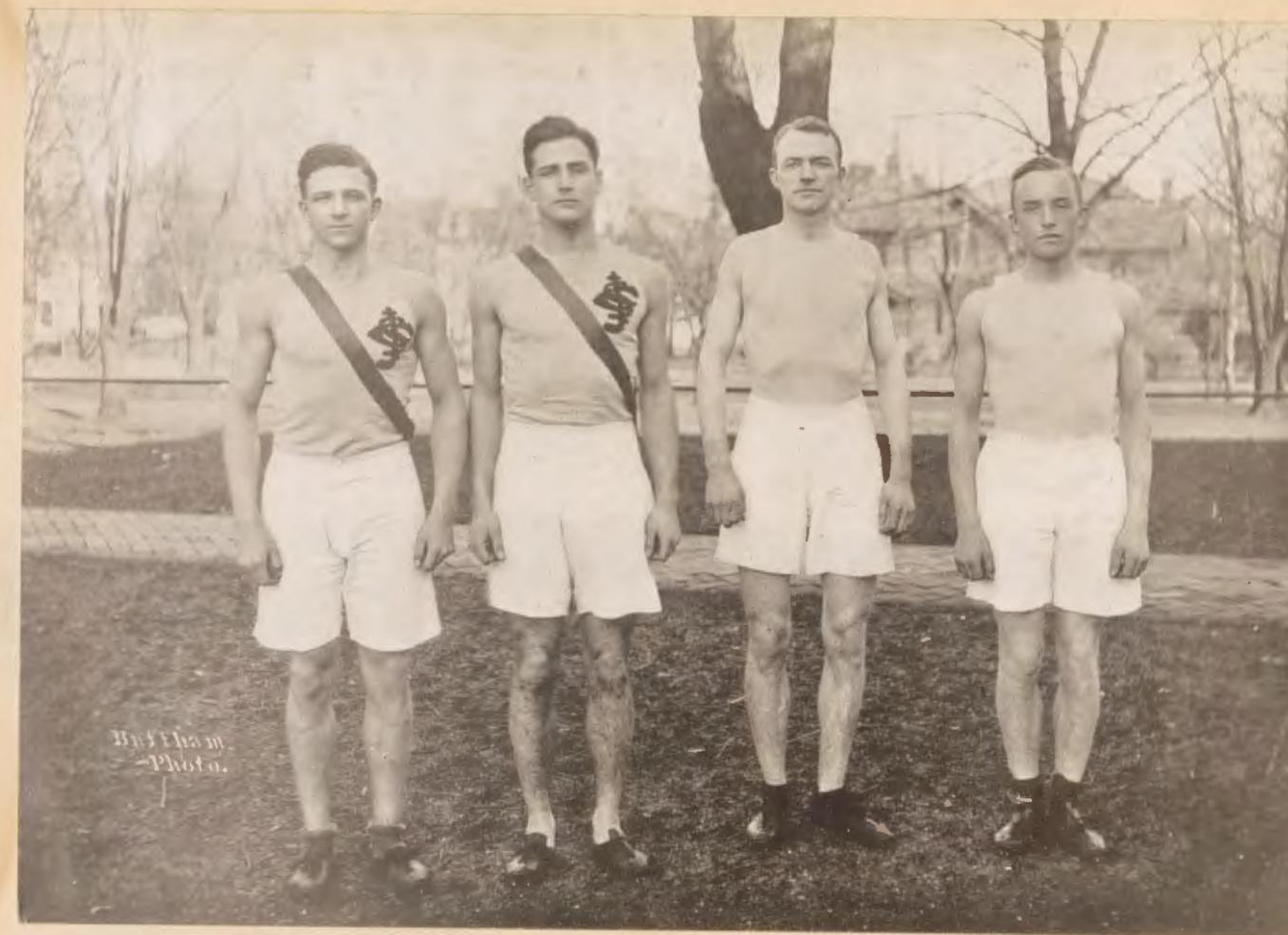
TRACK TEAM A FINE BRANCH OF SPORT, AND VERY SUCCESSFUL HERE