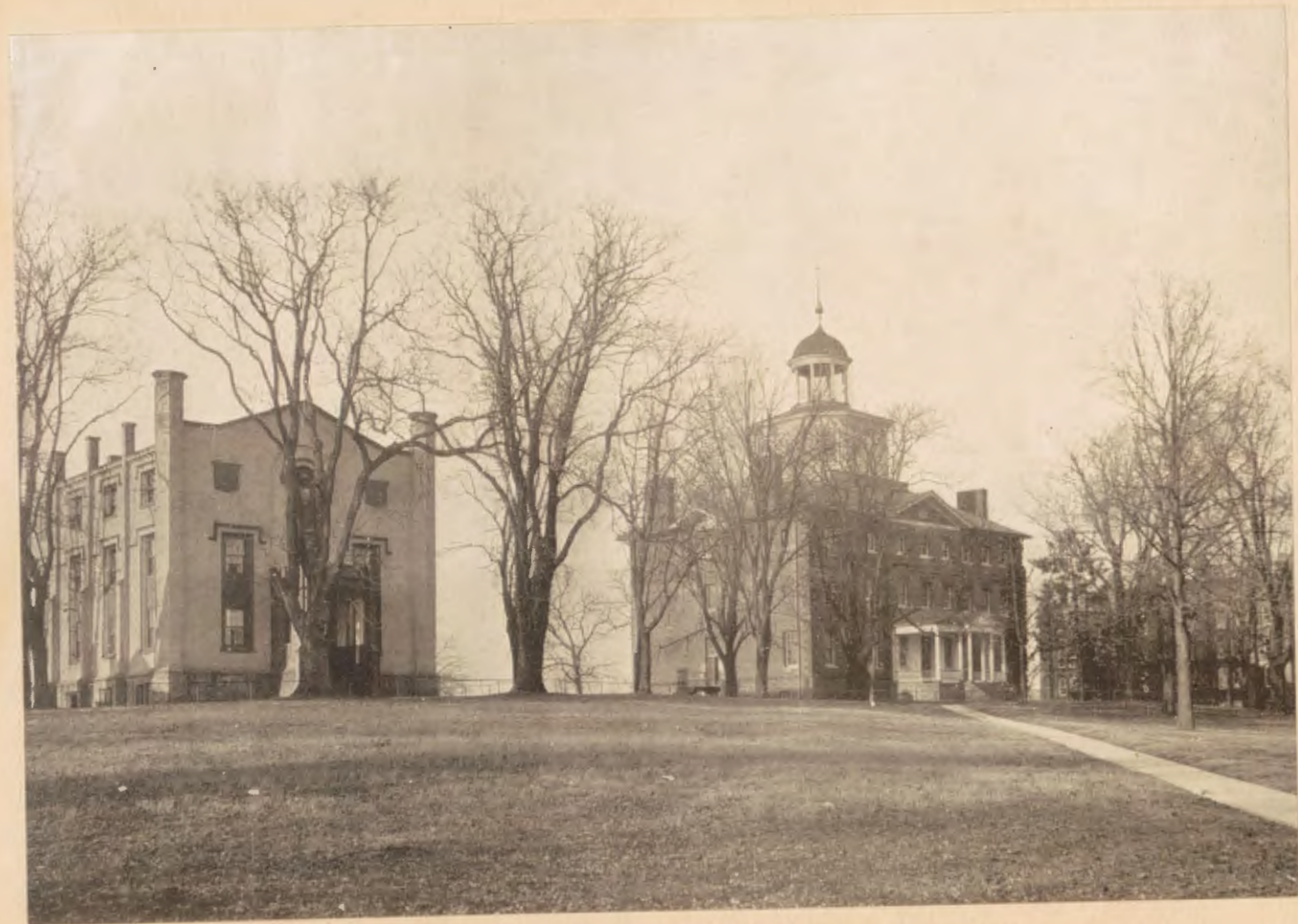
OLD McDOWELL HALL