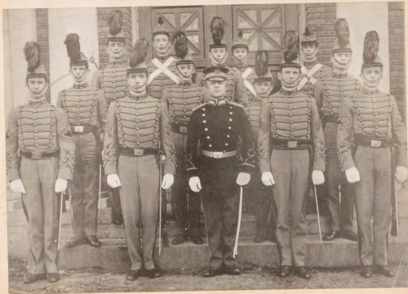
STAFF AND NON-COMMISSIONED STAFF OFFICERS OF THE CORPS