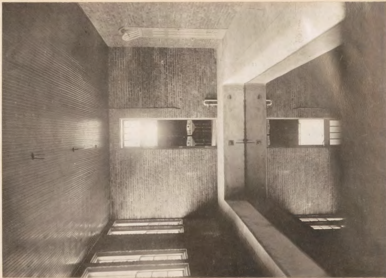
SWIMMING POOL, NEW GYMNASIUM