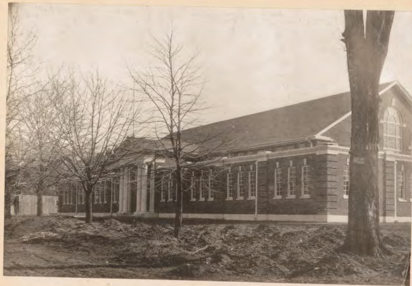
THE SPLENDID NEW GYMNASIUM AN UNSURPASSED HALL OF PHYSICAL CULTURE