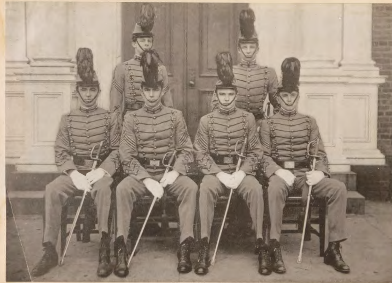
LINE OFFICERS OF THE CORPS