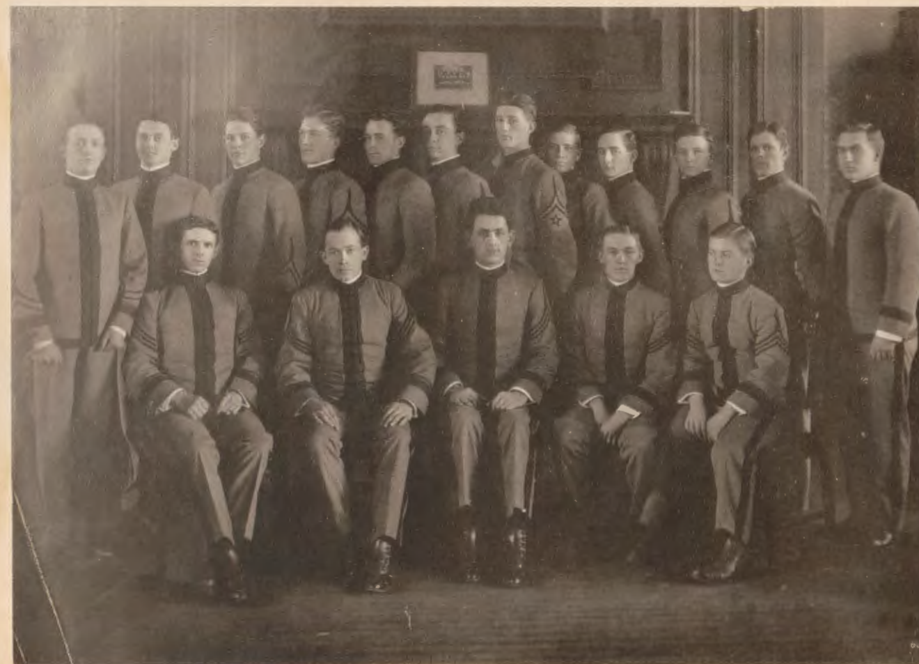
THE GLEE CLUB