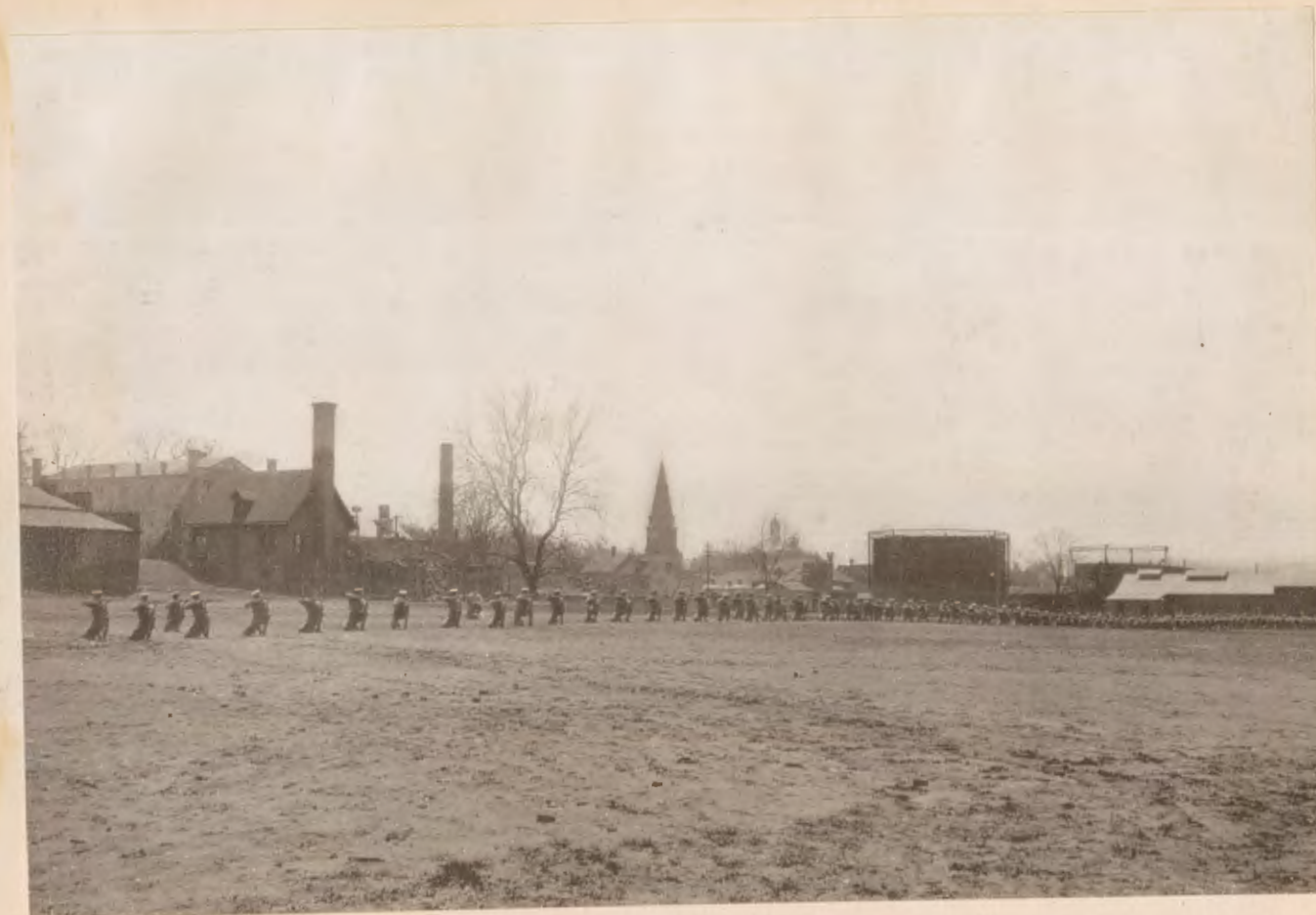
THE CORPS, AS SKIRMISHERS A LONG, THIN GREY LINE OF RIFLES