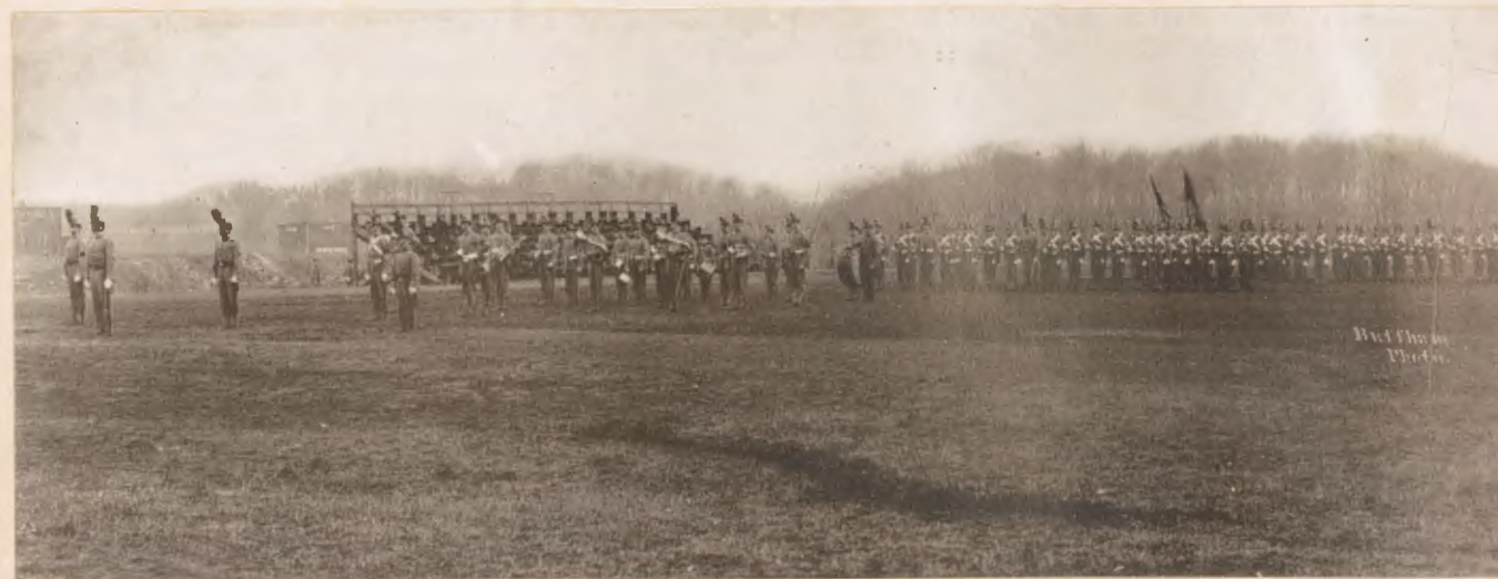
THE CORPS IN FULL DRESS, COLUMN OF COMPANIES ABOUT TO PASS IN REVIEW WITH BAND LEADING