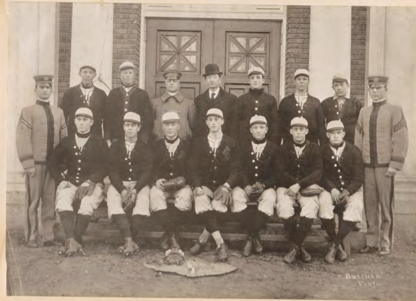
BASE BALL TEAM THIS TEAM HAD THE DISTINCTION OF DEFEATING THE NAVY