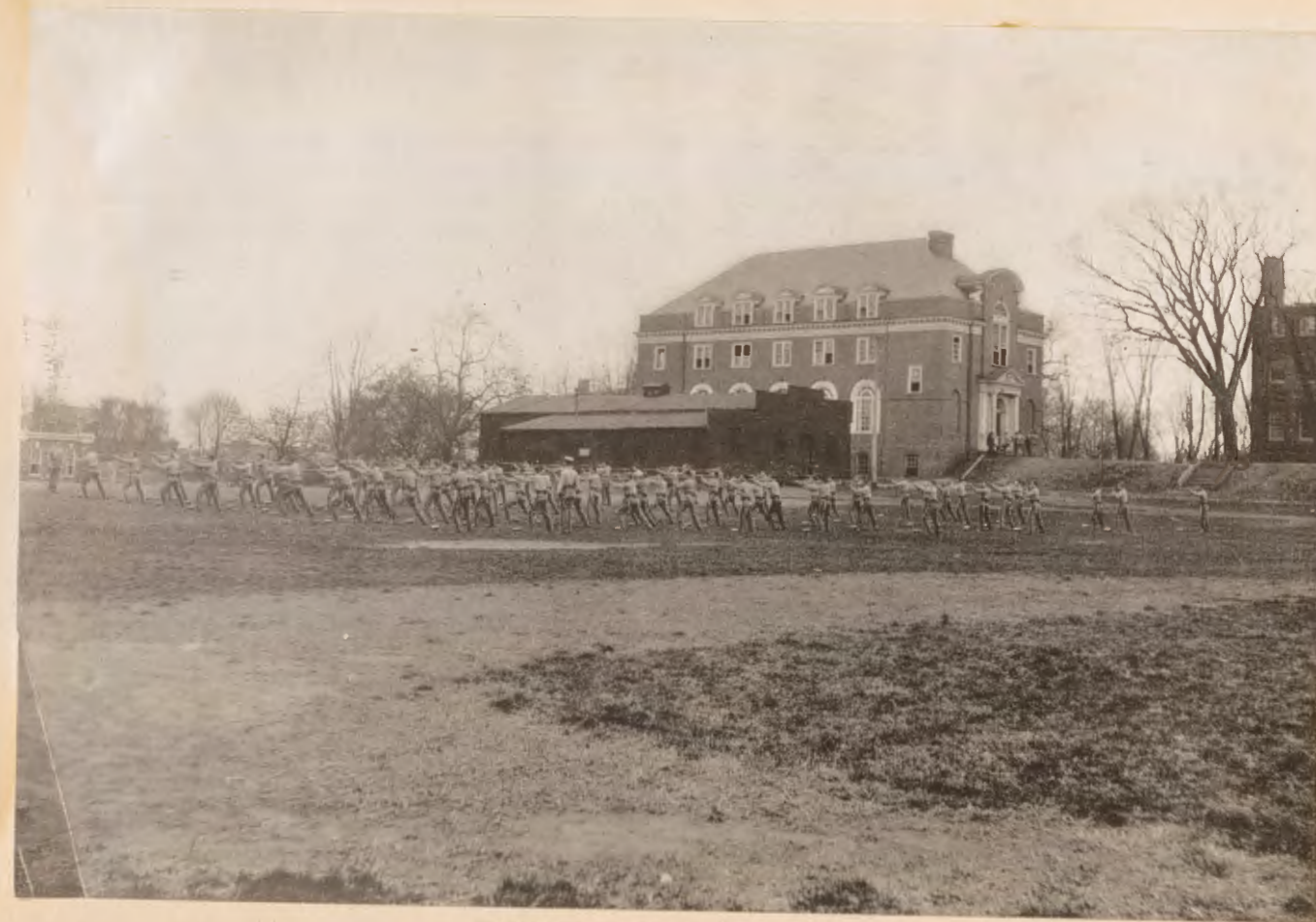
BAYONET EXERCISE—IN GREY SHIRTS