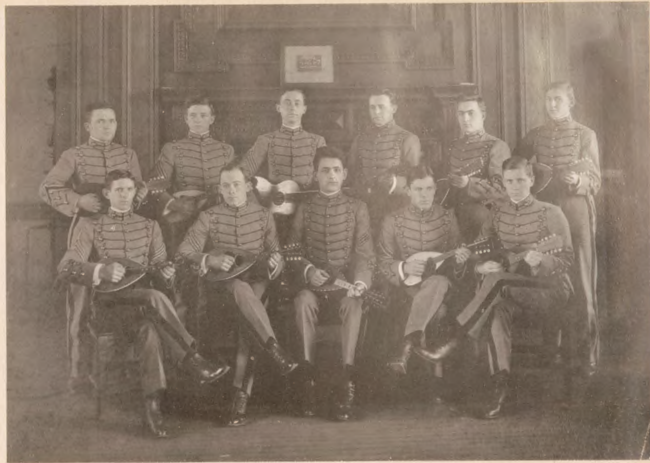
THE MANDOLIN CLUB