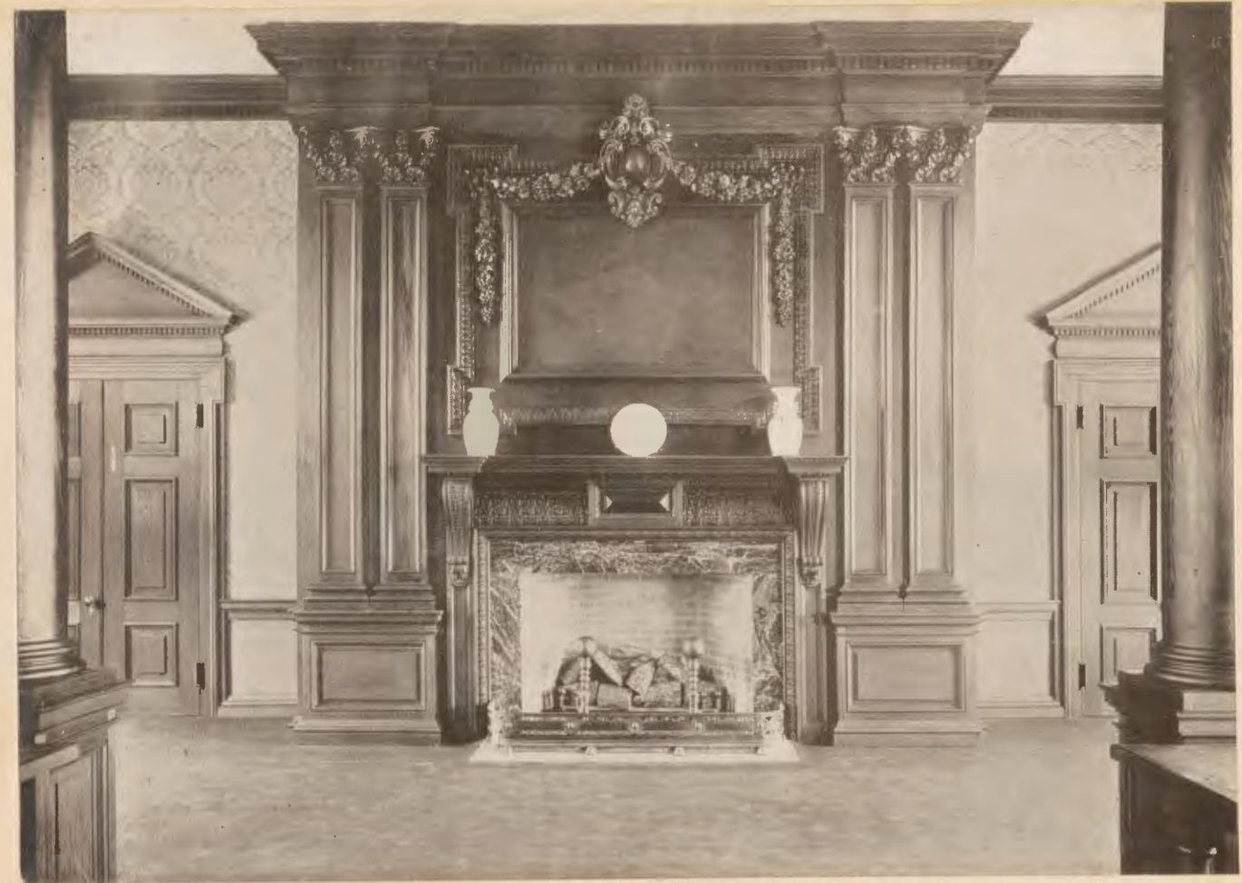
THE GREAT FIREPLACE IN THE CADETS' DINING ROOM