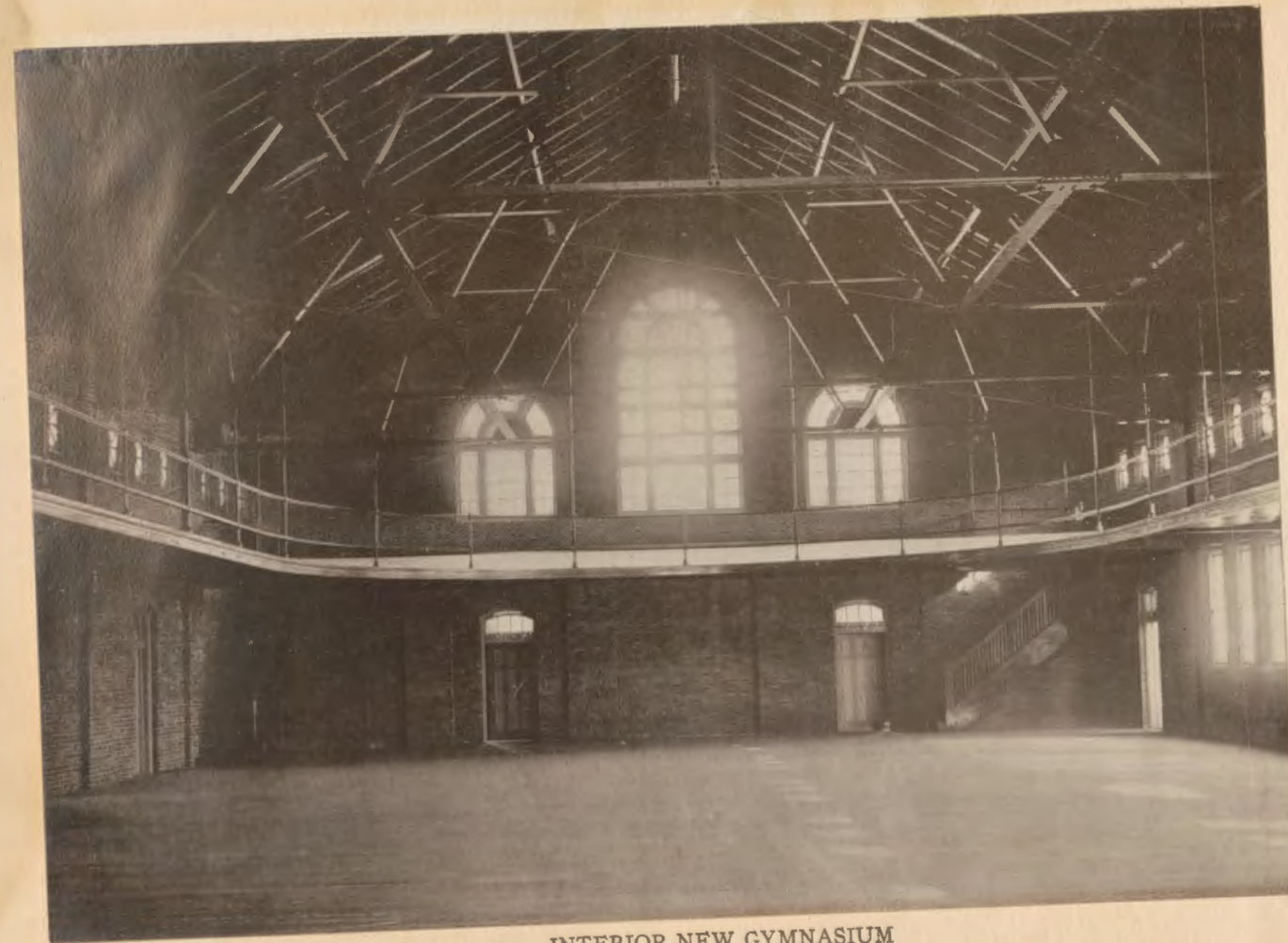
INTERIOR NEW GYMNASIUM THIS BUILDING HAS NO EQUAL IN MARYLAND AND FEW ANYWHERE