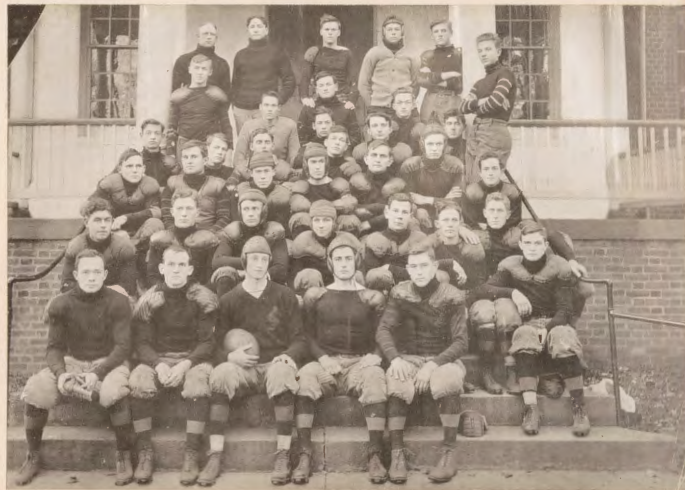
FOOT BALL SQUAD THESE CADETS WILL MAKE FUTURE FOOT BALL HISTORY FOR OLD ST. JOHN'S