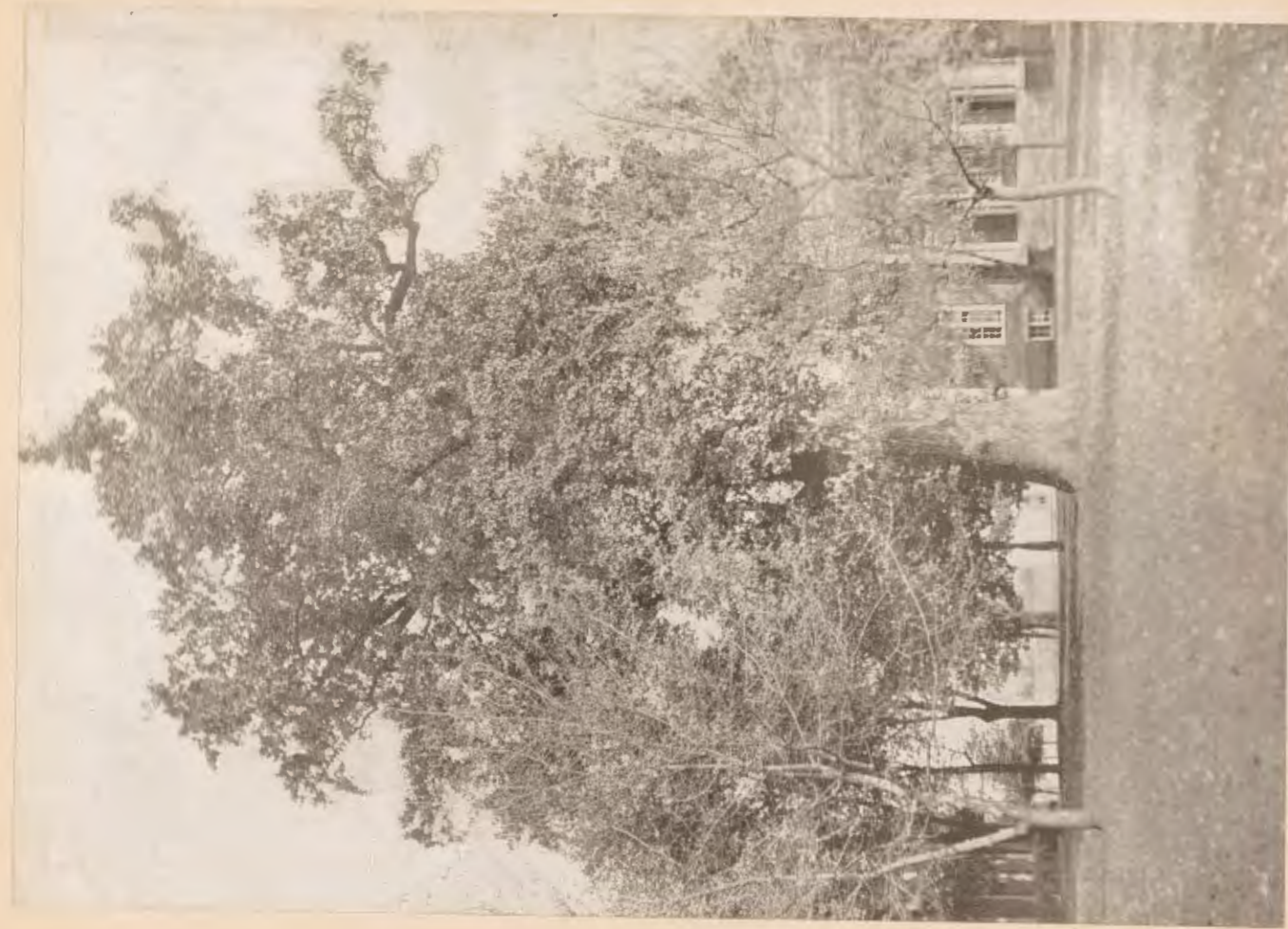
THE LIBERTY TREE SIX HUNDRED YEARS OLD, STANDS UPON THE BEAUTIFUL FRONT CAMPUS