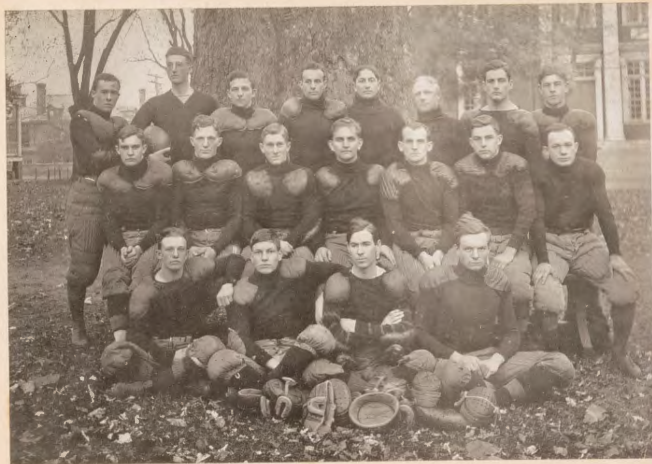
FOOT BALL TEAM DURING TWENTY-FIVE YEARS THESE TEAMS HAVE USUALLY BEEN SUPREME IN MARYLAND