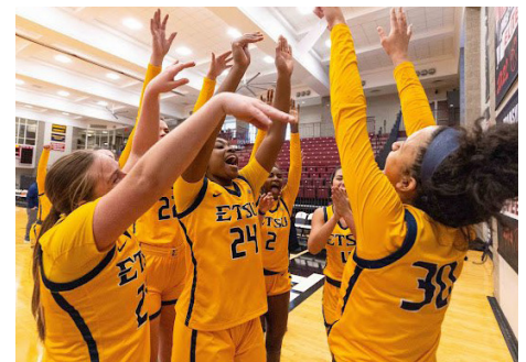
Members of the 2022-23 team pictured above. This team broke the school record for wins with 25, including two wins at the WBI Postseason Tournament on March 17-19, 2023 in Lexington, Kentucky.