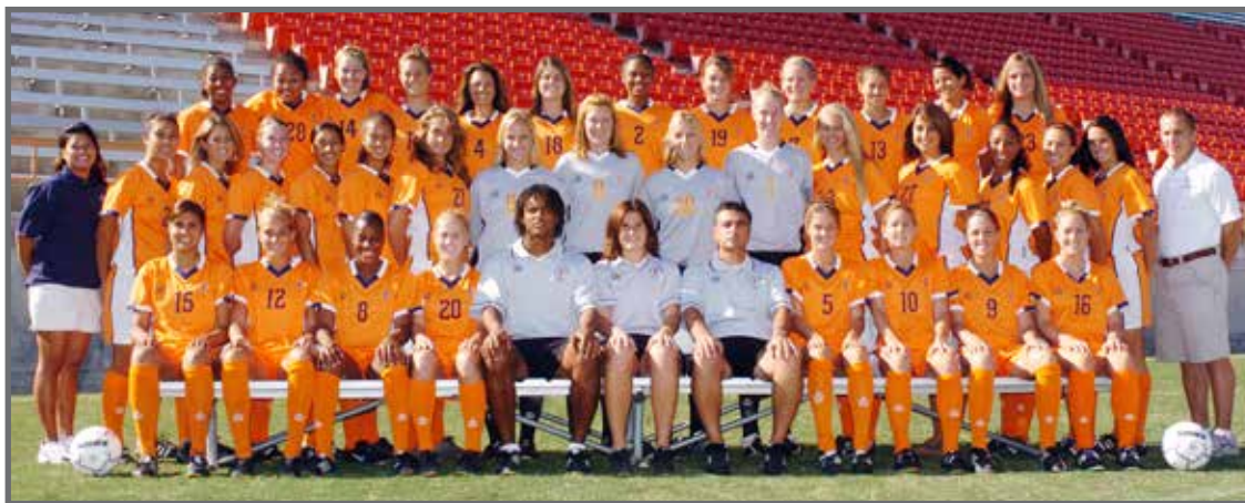
The 2005 Cal State Fullerton women's soccer team became the first Big West Conference school to host an NCAA Tournament match and advance to the third round of the NCAA Tournament. The Titans finished with a school-record 19 victories and their fourth Big West championship, posting NCAA wins over UNLV and USC before falling to Virginia on the road.