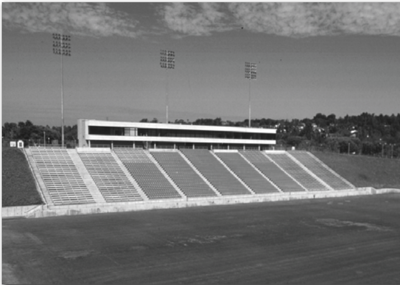
HOME SWEET HOME • Home of the Titans' men's and women's soccer teams, Titan Stadium was completed in 1992 and seats 10,000 fans.

As Cal State Fullerton establishes itself as one of the nation's elite programs, the cornerstone can be seen in the form of Titan Stadium.