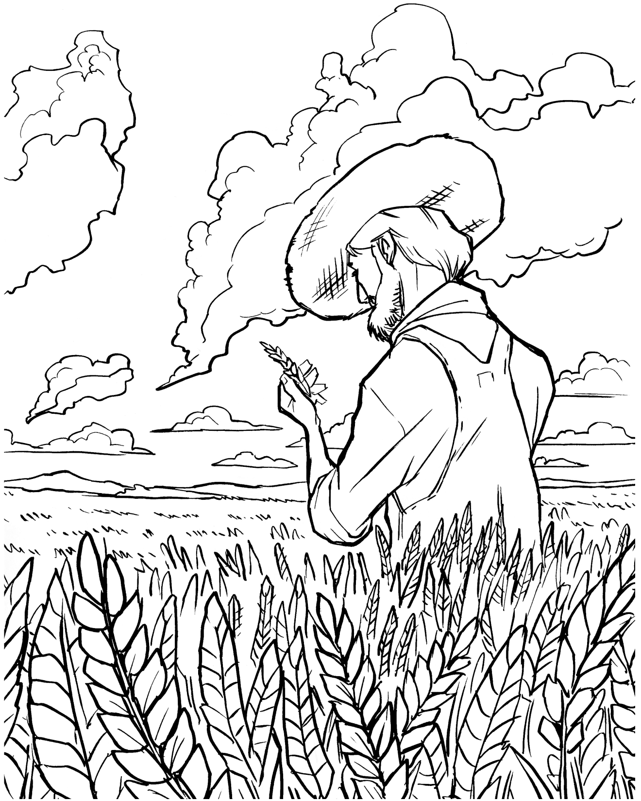
Mark 4:26-29 The Kingdom Grows