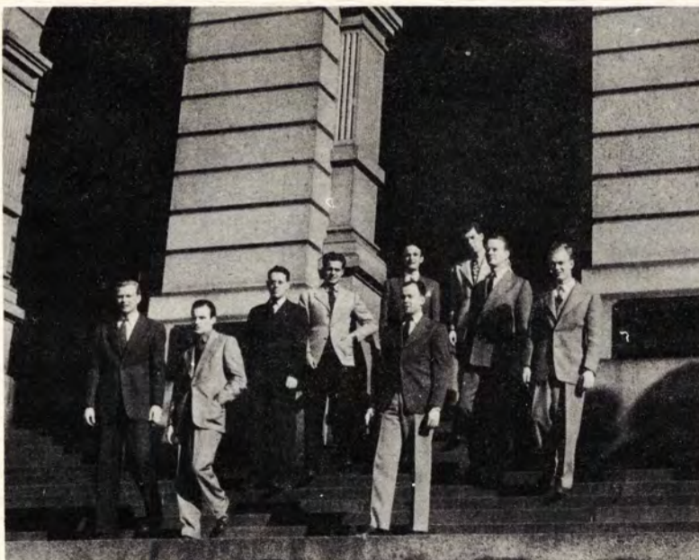
1947 FELLOWS ON STATE CAPITOL STEPS