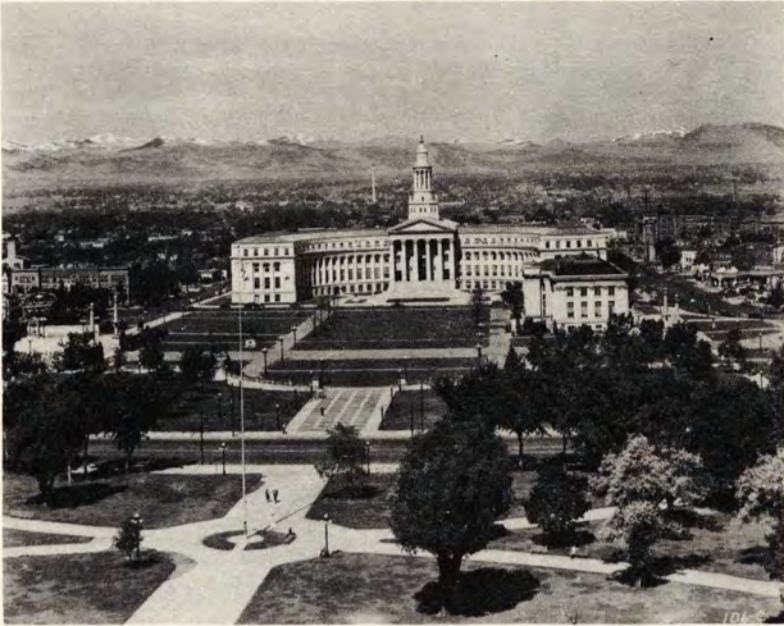
DENVER CIVIC CENTER