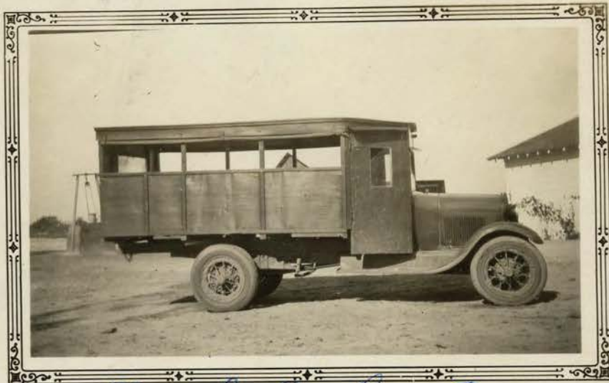
Nevada Co. Bus 3.