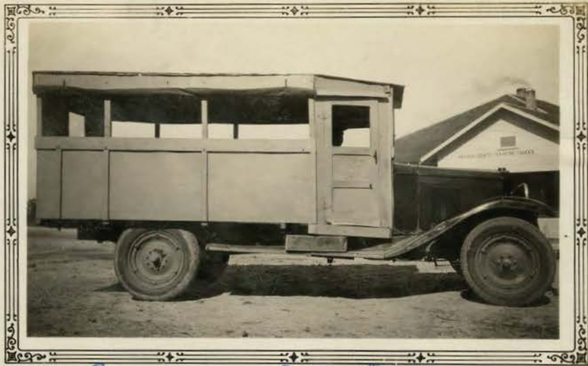
Nevada Co. Bus # 1