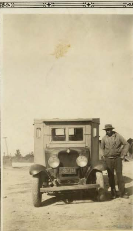
Nevada Co. Training School Bus # 2