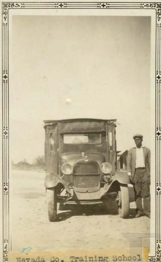
Nevada Co. Training School Bus # 3