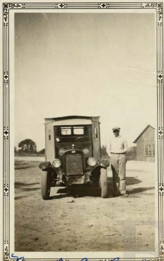
Nevada Co. Bus # 5