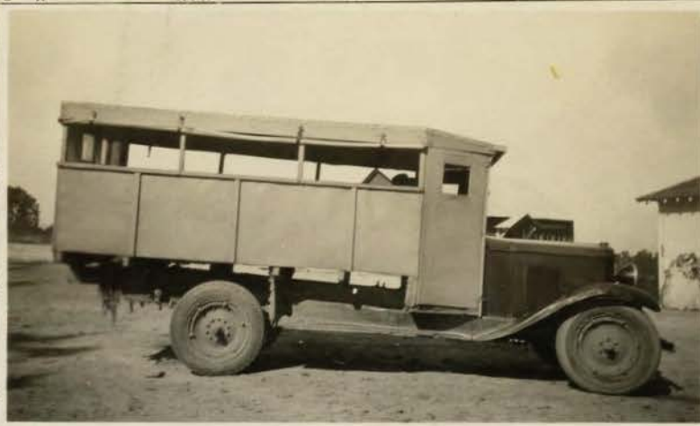
Nevada Co. Bus # 2.