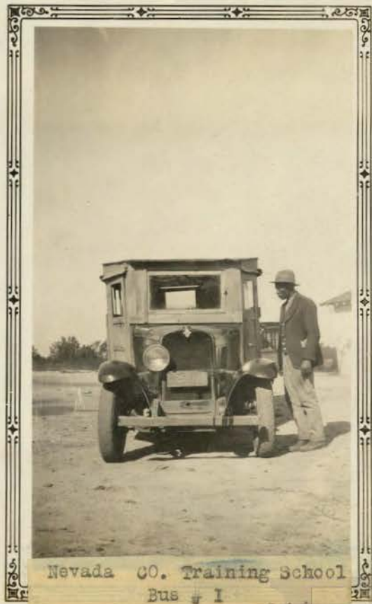
Nevada CO. Training School Bus # 1