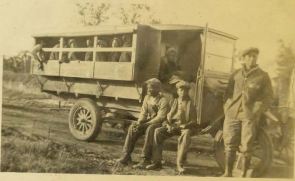
Red Bank School Bus, Bowie County, Texas.