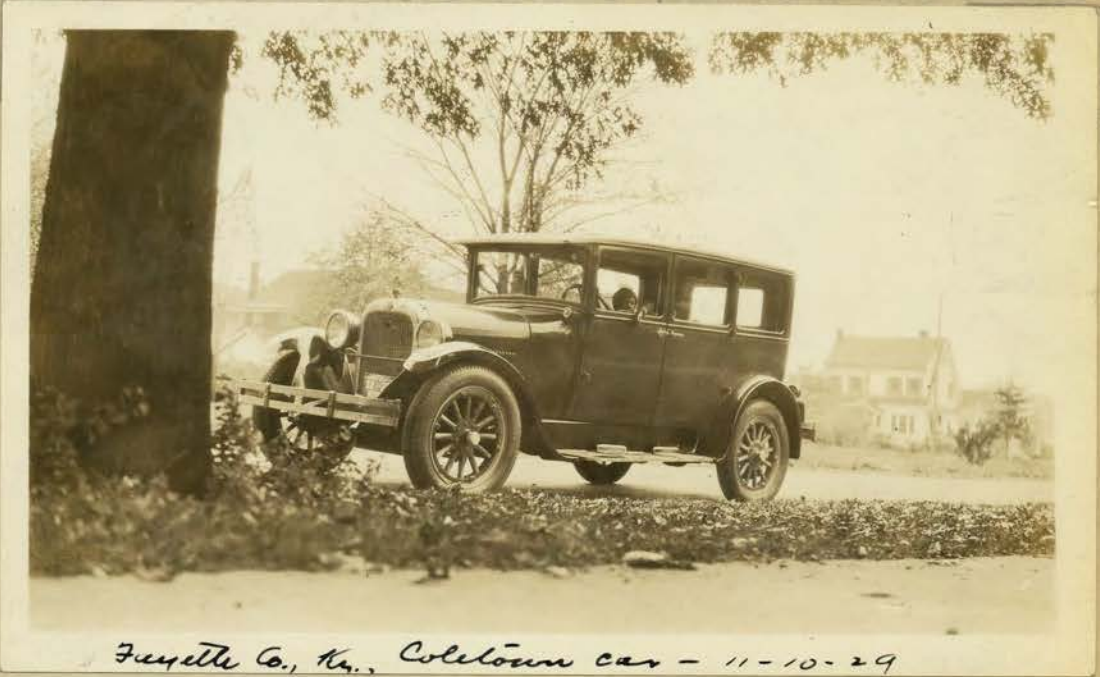
Fayette Co., Ky., Coleton car - 11-10-29