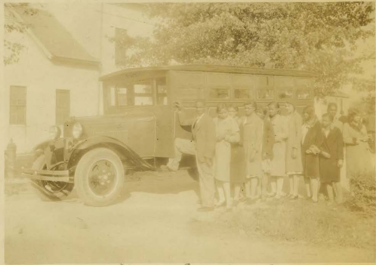
Vance County, N.C.