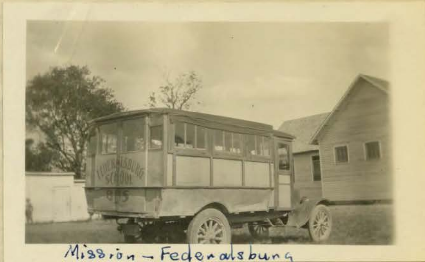
Mission - Federalsburg