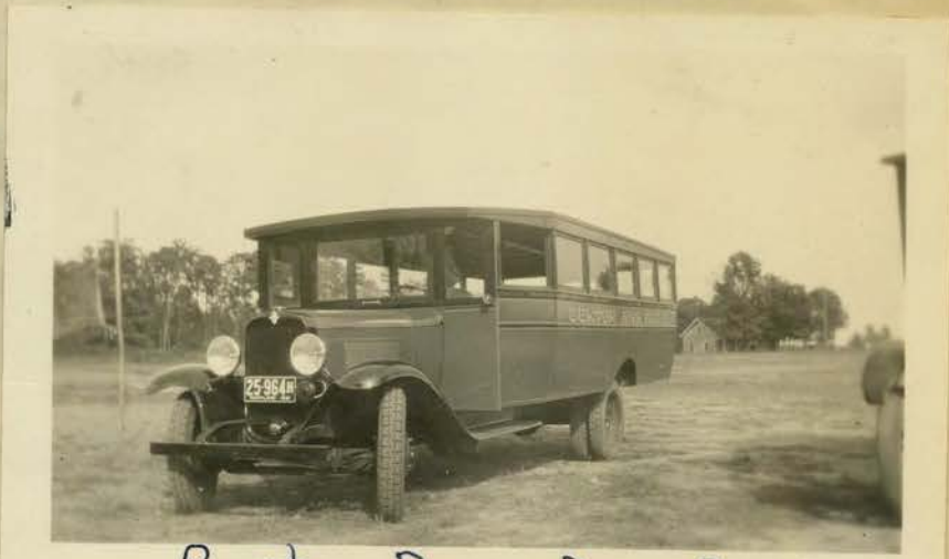
Preston Bus - Doven Road