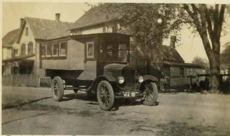
Bethlehem Bus. - Preston Route