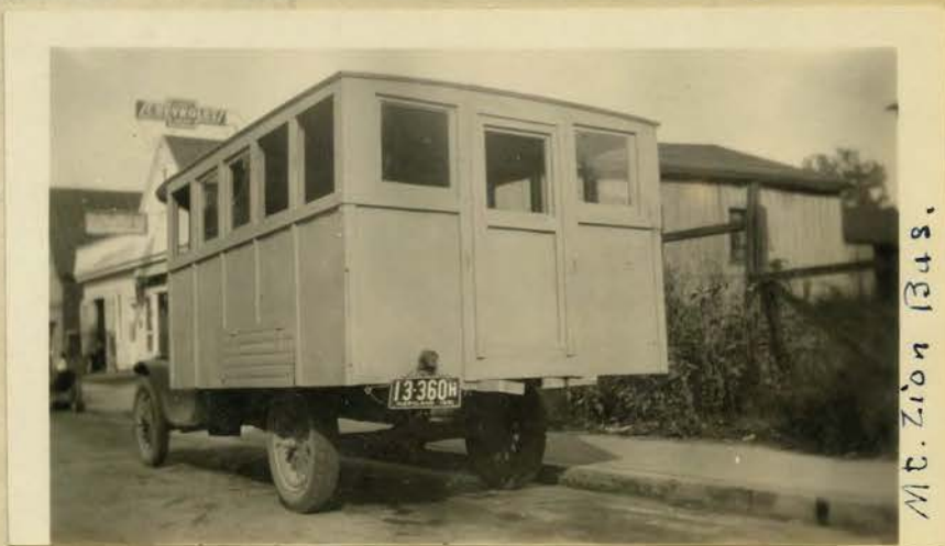
Mt. Zion Bus.