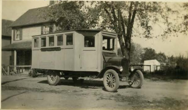
Mt. Zion Bus.

J. W. HUFFINGTON SUPERVISOR OF COLORED SCHOOLS