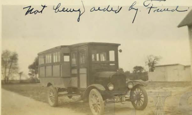
Mission School Bus - To Federalsburg