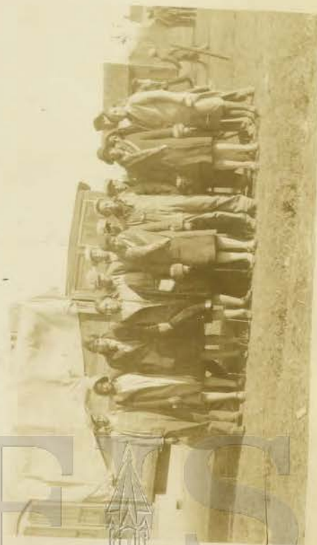
Children from the Wyatt & Kuehn's Ridge districts - Supervisor and driver.