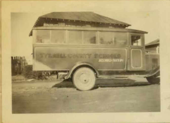
Attached are three views of the bus in Tyrrell County on which the Fund aided this year, your application No. 4.