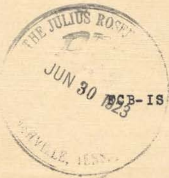
Supervisor of Rural Schools.