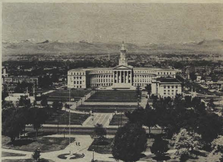
DENVER CIVIC CENTER

Ten graduate fellowships providing $100 per month for twelve months are awarded to students of superior ability and adequate background. Some fellowships may be awarded to applicants from particular areas depending upon the sponsorship. Undergraduate preparation in the fields of political science, economics, public administration, accounting and statistics is desirable. Candidates are rated on their academic record and their personal qualities of character, leadership and social responsibility. A candidate must make formal application before May 15, 1948. The program begins September 20, 1948. The regular University tuition of $480 for the four quarters will be charged.