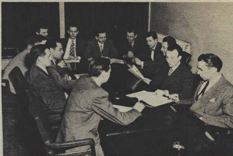
1948 FELLOWS IN SEMINAR SESSION

The Department of Government Management has been successful in placing its graduates in responsible positions throughout the United States. Graduates are now employed as heads of taxpayer organizations, municipal bureaus of research, as specialists with evaluating agencies, as technicians in all levels of government, and as university administrators and faculty members. In recent years each graduate of the Department has had the opportunity of selecting from several offers, the position in which his particular abilities might be utilized to the greatest advantage. A favorable situation exists in that the demand for individuals having practical training in government appears to be increasing. It is only reasonable, therefore, that beginning salaries of Government Management Fellows have been uniformly attractive. In addition, frequent promotion has been the experience of the Fellows.