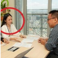
The interviewer asks a question.

Let's begin with some basic information about job interviews. A job interview is a formal meeting between an employer and a job seeker to decide if the person should get the job.