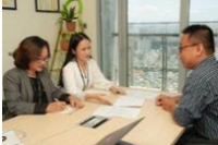
A job interview

In later videos, we will focus on the language of questions, show you some sample questions you could hear in a job interview, and how to answer them.