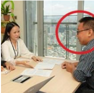
The interviewee responds.

The employer is called the interviewer and is the person asking the questions.