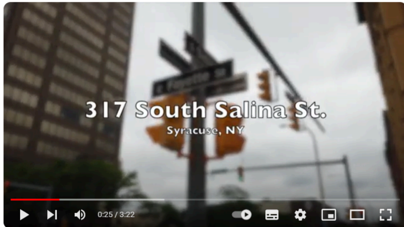
317 South Salina St