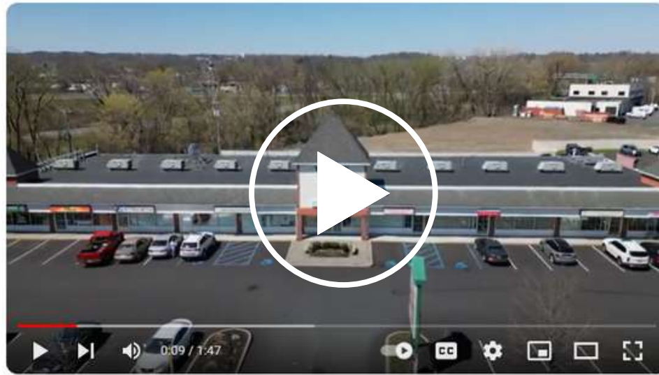
Discover the Vibrant Village Plaza in Green Island - A Drone Tour of the Exterior