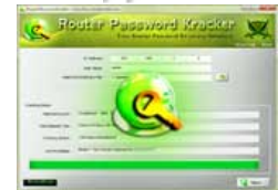
Router Password Cracker v1.0