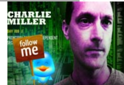
Hackers Exploit New IE Zero-day Vulnerability