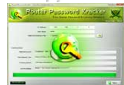
Router Password Cracker v1.0