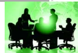
Reference Guide - Reversing & Malware Analysis Training