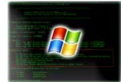
Exe Scan v2.6