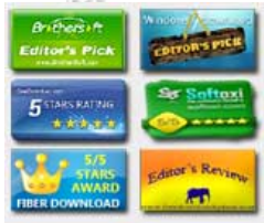
Awards for our softwares from leading Download Sites