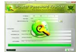
Router Password Cracker v1.0