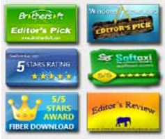
Awards for our softwares from leading Download Sites