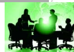
Reference Guide - Reversing & Malware Analysis Training