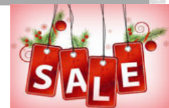
Get upto 70% OFF on NetCertScanner. Offer valid for first 25 customers only