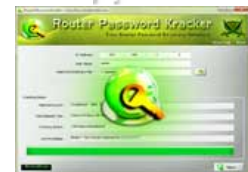
Router Password Cracker v1.0