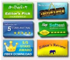
Awards for our softwares from leading Download Sites