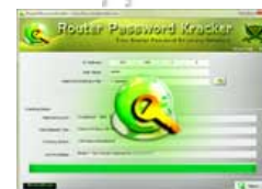
Router Password Kracker v1.0