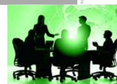
Reference Guide - Reversing & Malware Analysis Training