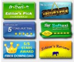
Awards for our softwares from leading Download Sites