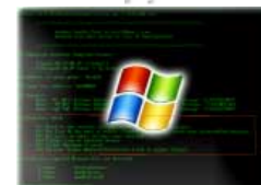
Exe Scan v2.6