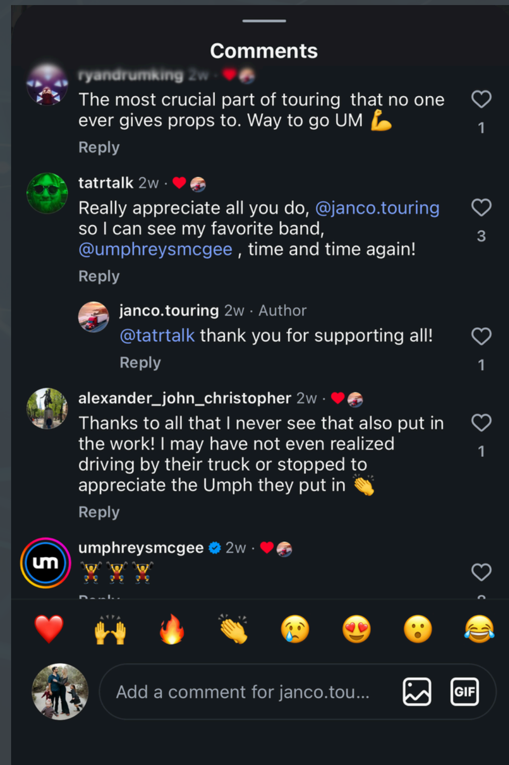
Fans Recognizing the People Behind the Performance

The band performs for the fans. We move for the fans. Together, we're doing it all for the fans.