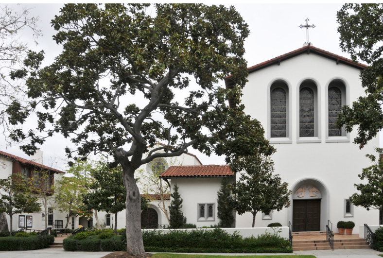
All Saints' Episcopal Church in Beverly Hills