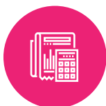
Pharmacovigilance and safety report writing