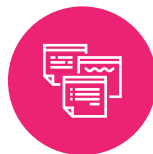
Regulatory services, including dossier preparation for all countries