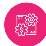
Contract services and grants management