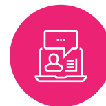
Clinical monitoring including remote and adaptive monitoring