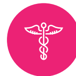
Medical writing including protocols, submissions, and reports