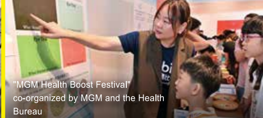
"MGM Health Boost Festival" co-organized by MGM and the Health Bureau