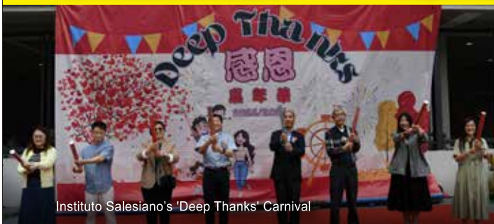
Instituto Salesiano's 'Deep Thanks' Carnival