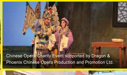
Chinese Opera Charity Event supported by Dragon & Phoenix Chinese Opera Production and Promotion Ltd.