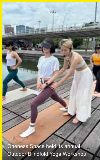
Oneness Space held its annual Outdoor Blindfold Yoga Workshop