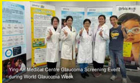
Ying An Medical Centre Glaucoma Screening Event during World Glaucoma Week