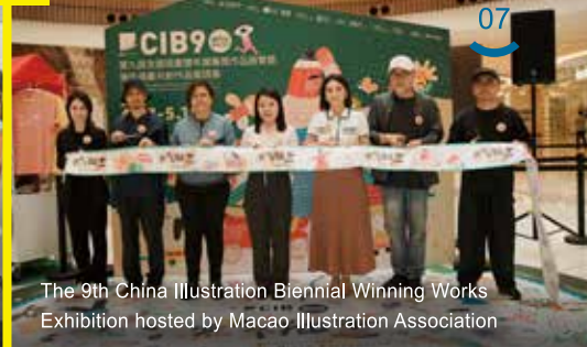
The 9th China Illustration Biennial Winning Works Exhibition hosted by Macao Illustration Association