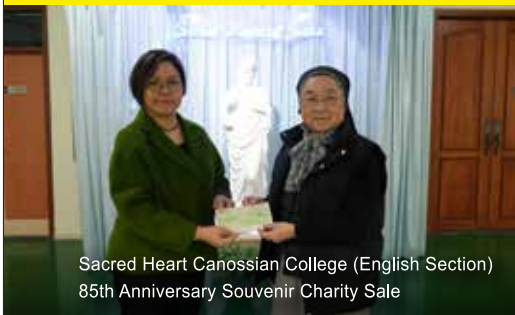
Sacred Heart Canossian College (English Section) 85th Anniversary Souvenir Charity Sale