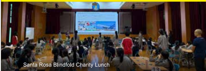
Santa Rosa Blindfold Charity Lunch