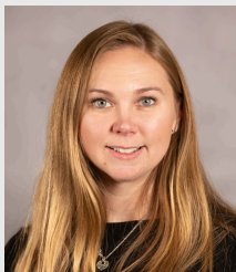
Annette West Communications