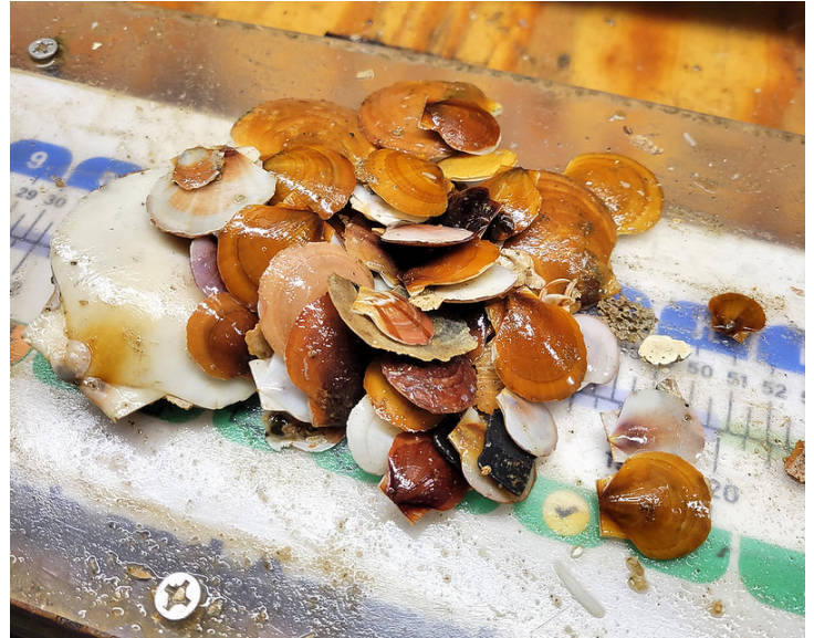
Pictured above are scallops harvested during a June 2022 RSA trip in the Mid-Atlantic Bight. The Virginia Institute of Marine Science (VIMS) survey team encountered a wide range of scallop sizes. Pockets of seed scallops were interspersed throughout the area.

OTHER ISSUES: The Council received brief updates on the Northern Gulf of Maine fishery, preliminary 2022 survey sightings, and recent fishery performance in Nantucket Lightship South. Highlights are noted in this presentation .