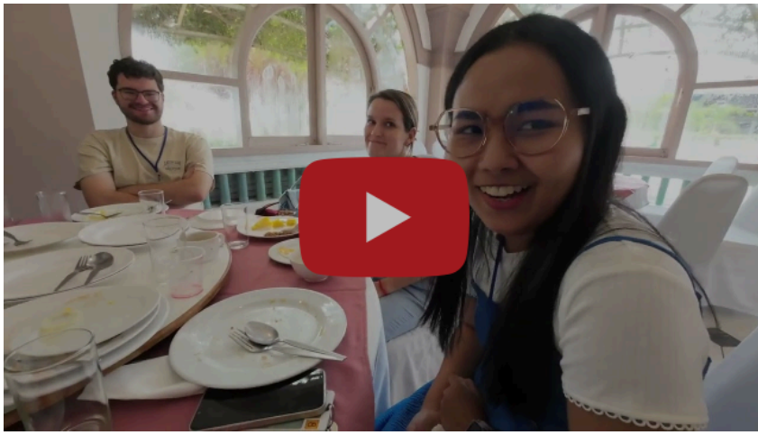
Here is video of the highlights from our CSL Retreat!