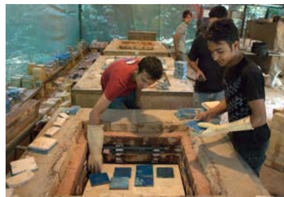
Cultural events such as Dastangoi and street plays performed by local youth attract many first time visitors and raise awareness on health, environment, sanitation issues. Street improvements will enhance the urban environment and local youth learning traditional crafts such as glazed tile making (bottom) have secured economic opportunities.