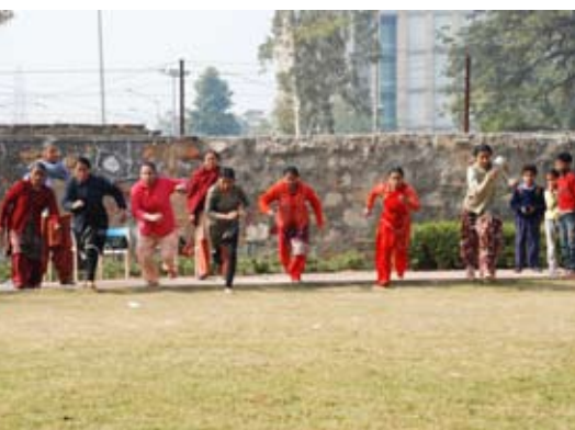
Education, Health, Urban improvement initiatives aim at improving Quality of Life for local communities.

Education: The education interventions cover preschool, school going, adolescents and adults. At the Municipal primary school, the programmes aim to provide quality education to the 630 children enrolled. Major renovations of the school building have been coupled with faculty development, the placement of community teachers and improved school management, which has led to increased enrolment and attendance. Computer courses are regular and street computer kiosks have been set up to ensure improved access to computers.