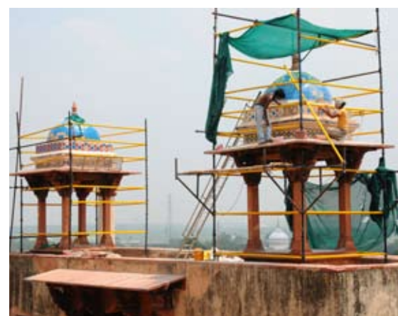
Conservation works at Humayun's Tomb, such as repairing the sandstone platform (top), replacing 20 th century cement flooring with original stone paving (centre) and restoring glazed tiles to the canopies (bottom) are carried out by craftsmen using traditional tools, materials and building techniques.