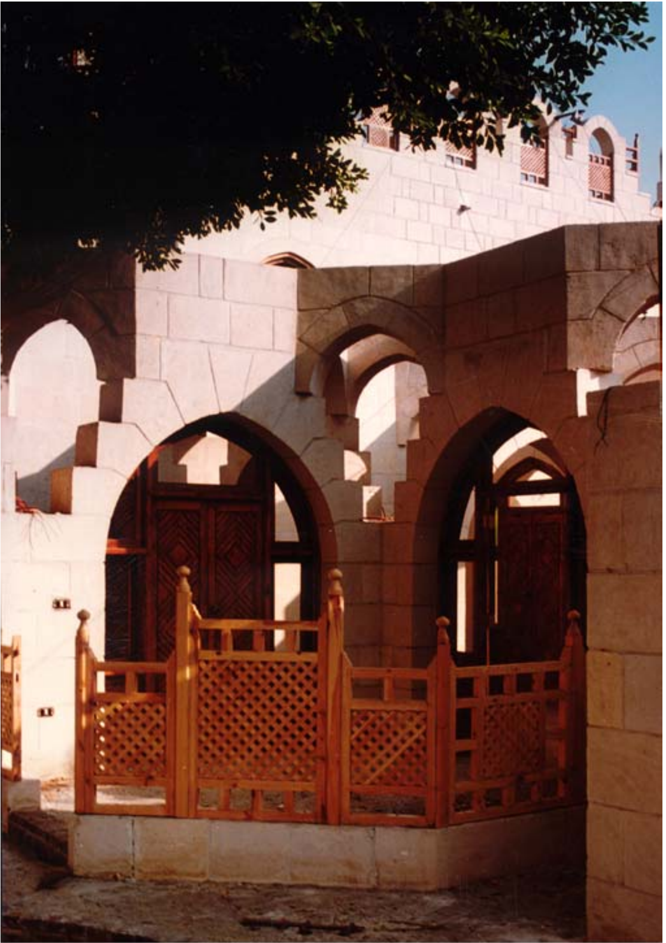
Workshop, rear garden area