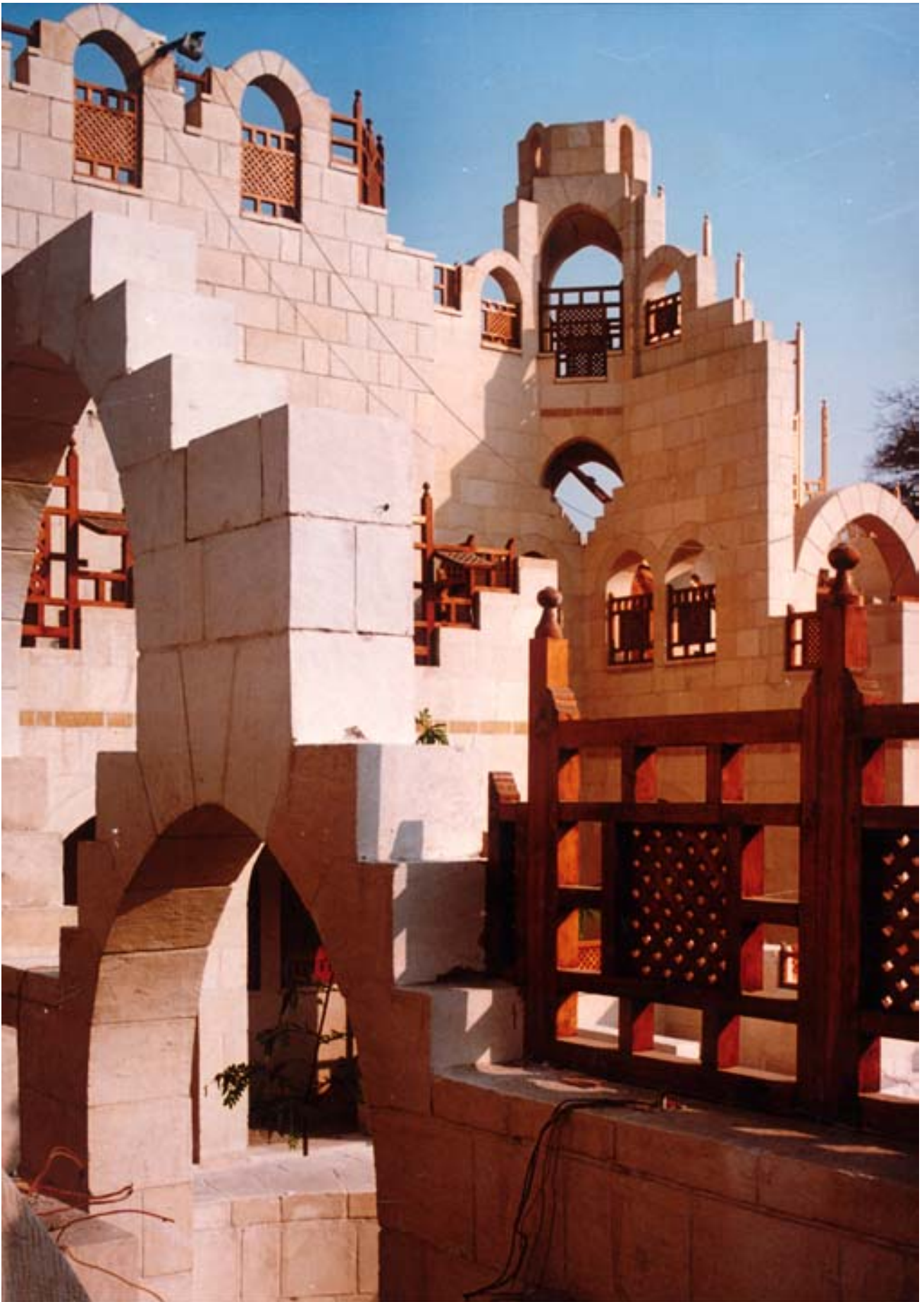
Arches, domes and walls are of local stone