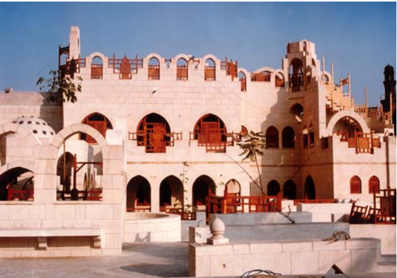
Children's library and workshop. loadbearing walls are of local stone