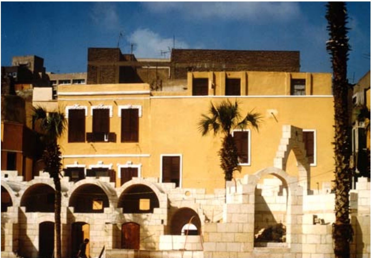
Street/wall enclosure, with existing urban fabric in the background