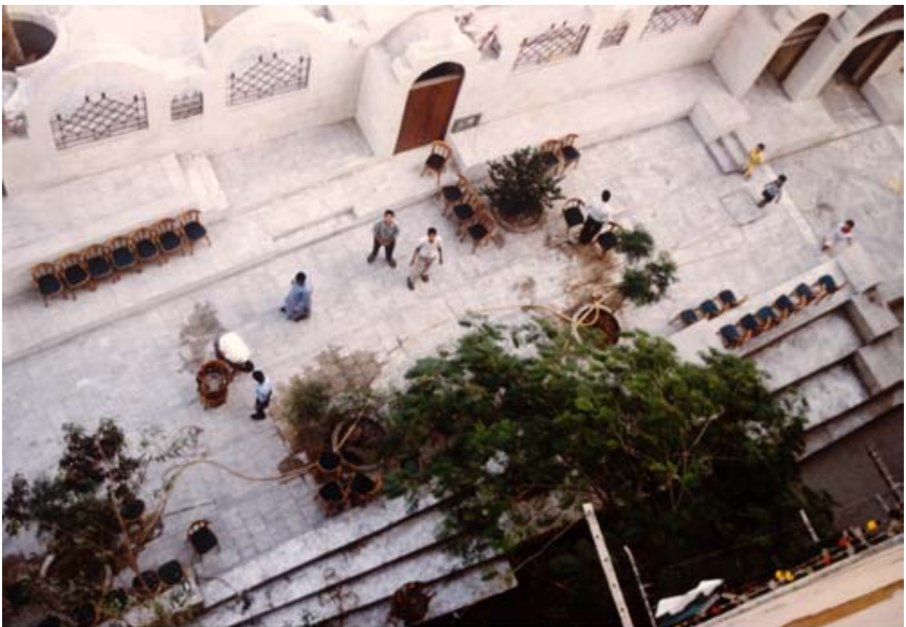
Street/wall enclosure, viewed from above